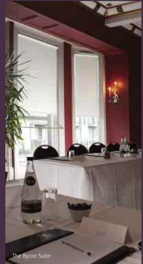
The Byron Suite

We at The Crown Hotel Harrogate understand that each group of people have different requirements and have developed a series of flexible packages for both day and residential meetings. We are committed to working with you to ensure your objectives are achieved and we offer a range of activities ideal for entertaining clients, product launches, encouraging team bonding or just having fun and getting to know each other.