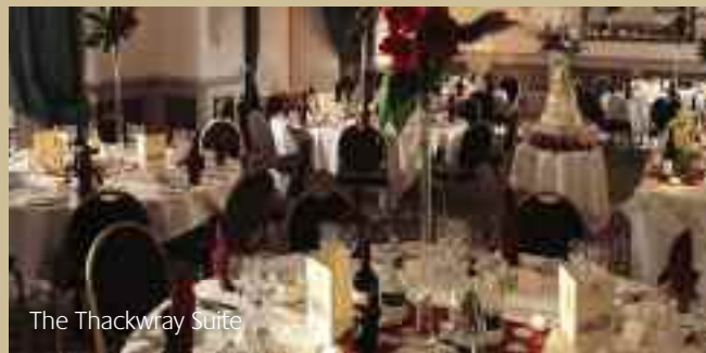
The Thackray Suite

With the capacity to hold intimate dinner parties from 10 guests or receptions for up to 700, why not contact our Event Manager on 01423 706604 who will be happy to discuss your individual requirements to make your event truly unique.