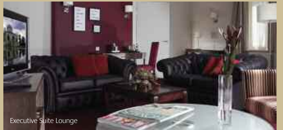
Executive Suite Lounge

The beautiful guest bedrooms and suites have been furnished with comfortable fittings, flatscreen television, Egyptian cotton linen and duvets. All of the bedrooms are individually presented, some overlooking the famous Stray parkland.