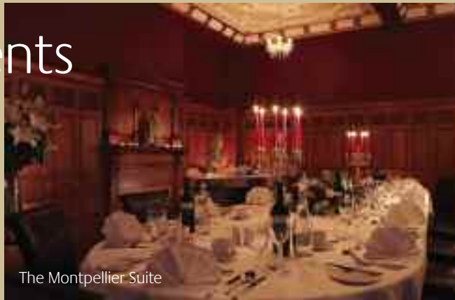
The Montpellier Suite

Here at The Crown Hotel Harrogate we pride ourselves on our reputation as one of the leading venues in the area for wedding receptions, dinner dances, awards ceremonies, charity fundraisers and private dinners.