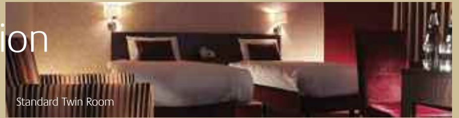
Standard Twin Room

The beautiful guest bedrooms and suites have been furnished with comfortable fittings, flatscreen television, Egyptian cotton linen and duvets. All of the bedrooms are individually presented, some overlooking the famous Stray parkland.