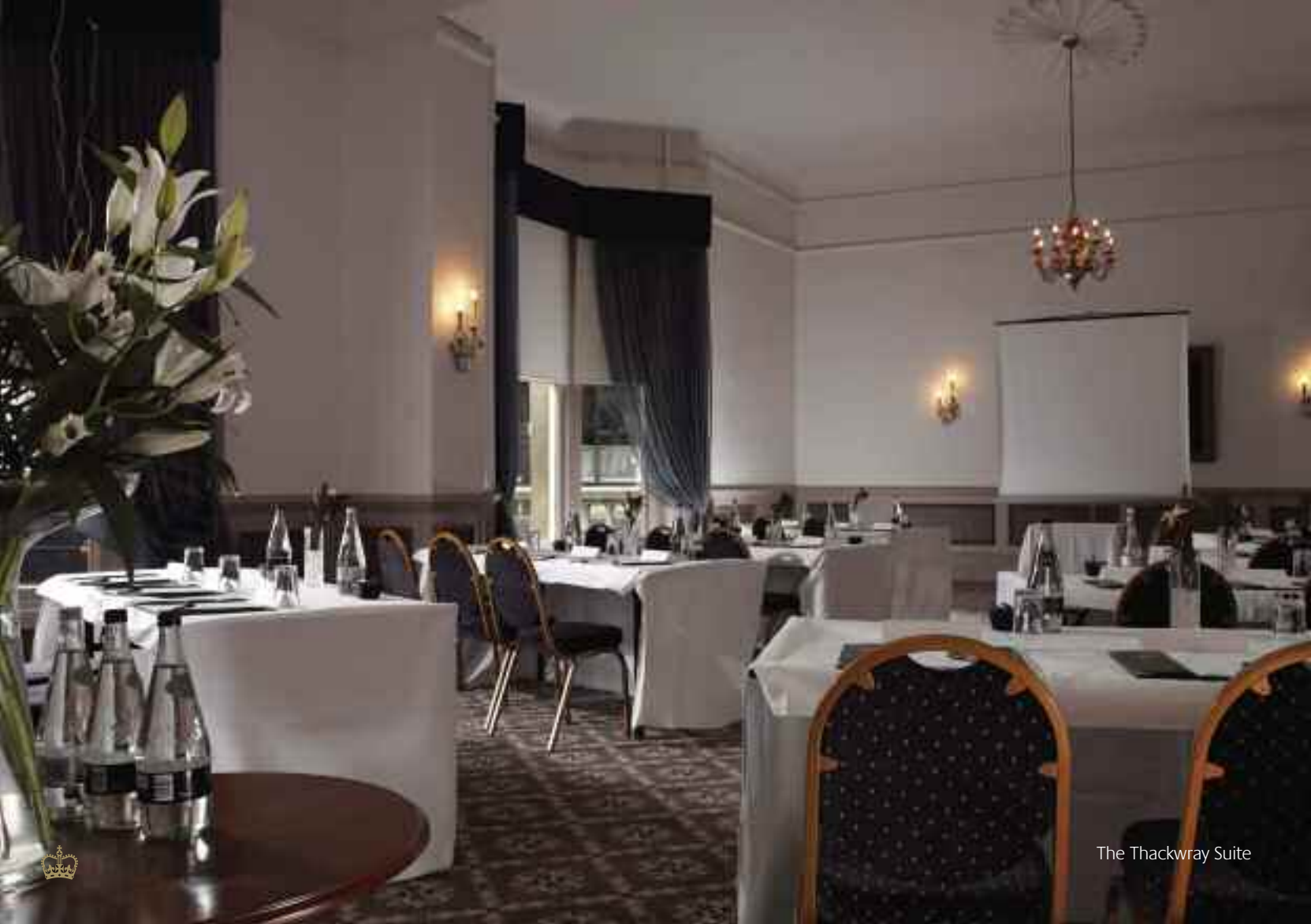
The Thackwray Suite

We at The Crown Hotel Harrogate understand that each group of people have different requirements and have developed a series of flexible packages for both day and residential meetings. We are committed to working with you to ensure your objectives are achieved and we offer a range of activities ideal for entertaining clients, product launches, encouraging team bonding or just having fun and getting to know each other.