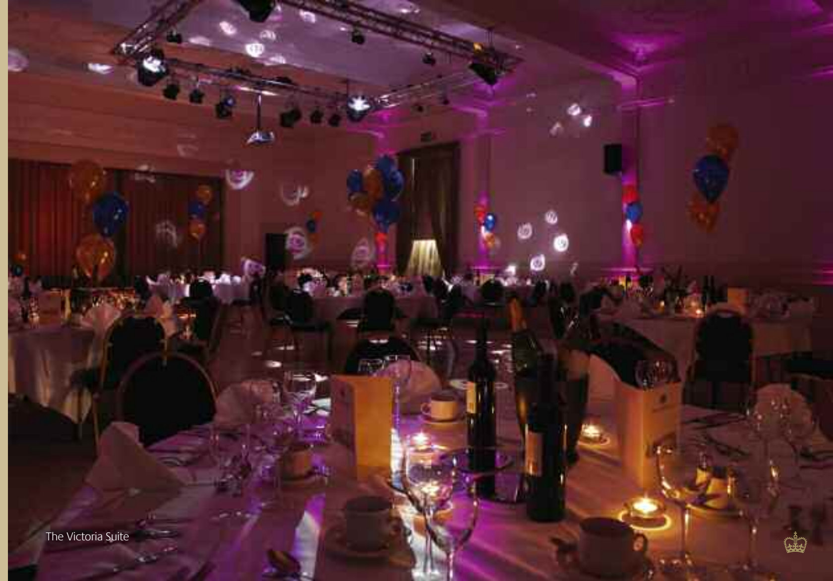
The Victoria Suite